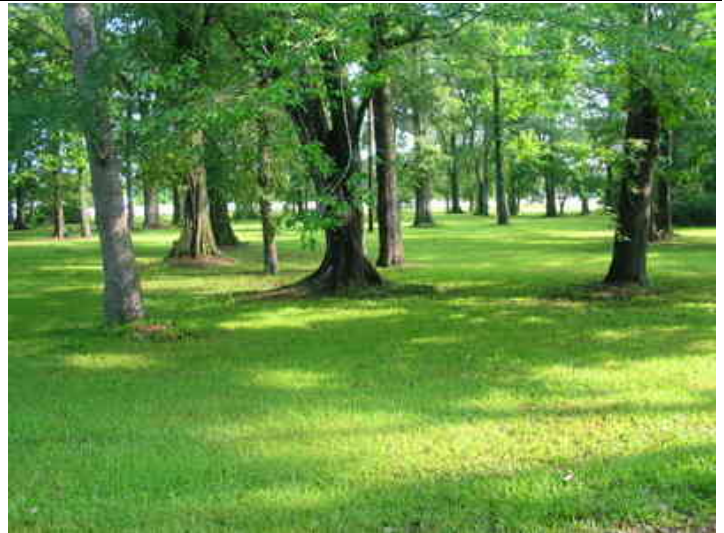
9178 Hooper Rd