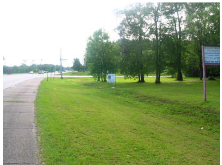
Hooper Street View