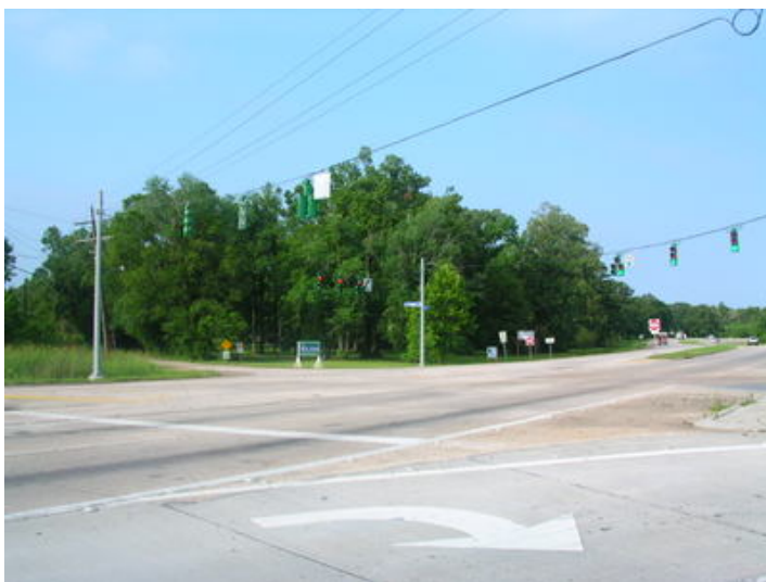
9178 Hooper Inter